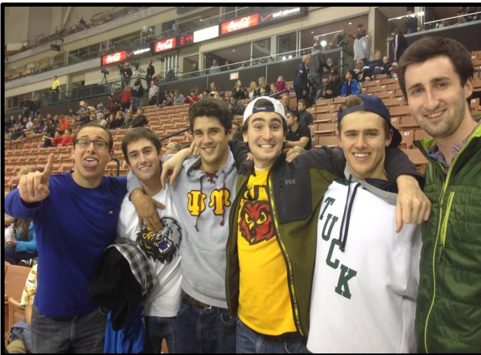
A particularly spirited group of U'ies at a Manchester Monarchs hockey game.