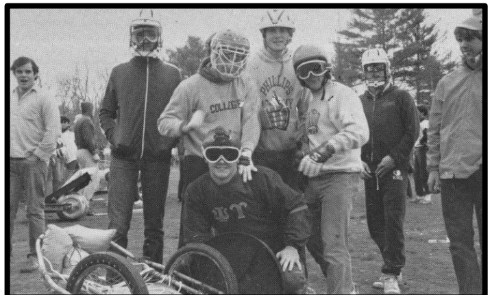
The early days of chariot racing (y. 1982)