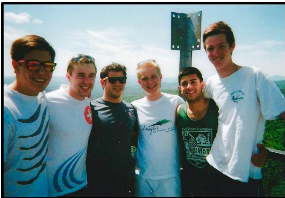
Members of the '16 class atop Gile fire tower during their sophomore summer

Conversation flowed as lazily as the river, and we eventually decided to return to civilization, but I believe we all left something unforgettable in its simple beauty on the river that day.