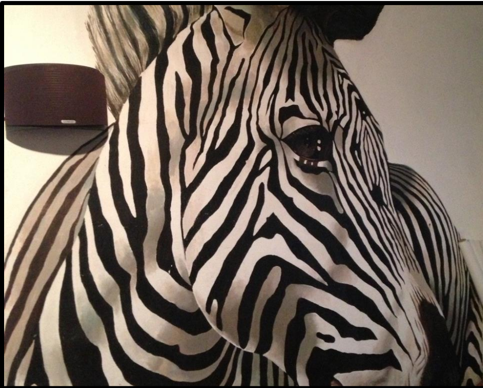
The Zebra (wall mural) keeps a watchful eye over 7 West Wheelock

Yours in the bonds, Tobin Paxton '15 Archon