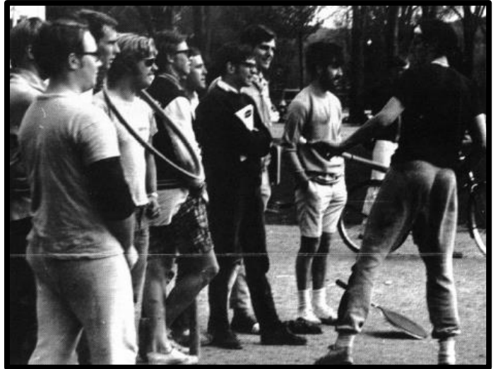
Brothers watch as Psi U's softball machine wins again (y. 1969)