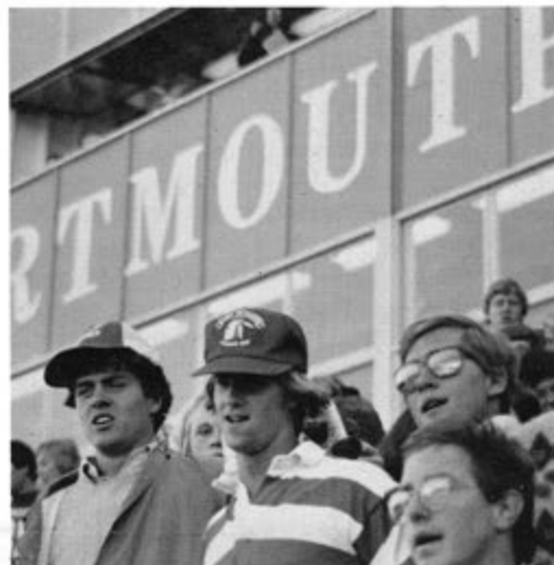
Pres., V.P., Treasurer and Rush Chair take in a football game.