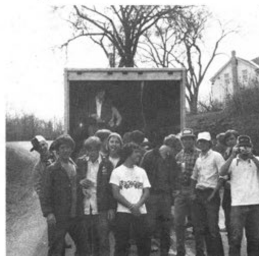
Bike Race participants midway to Skidmore