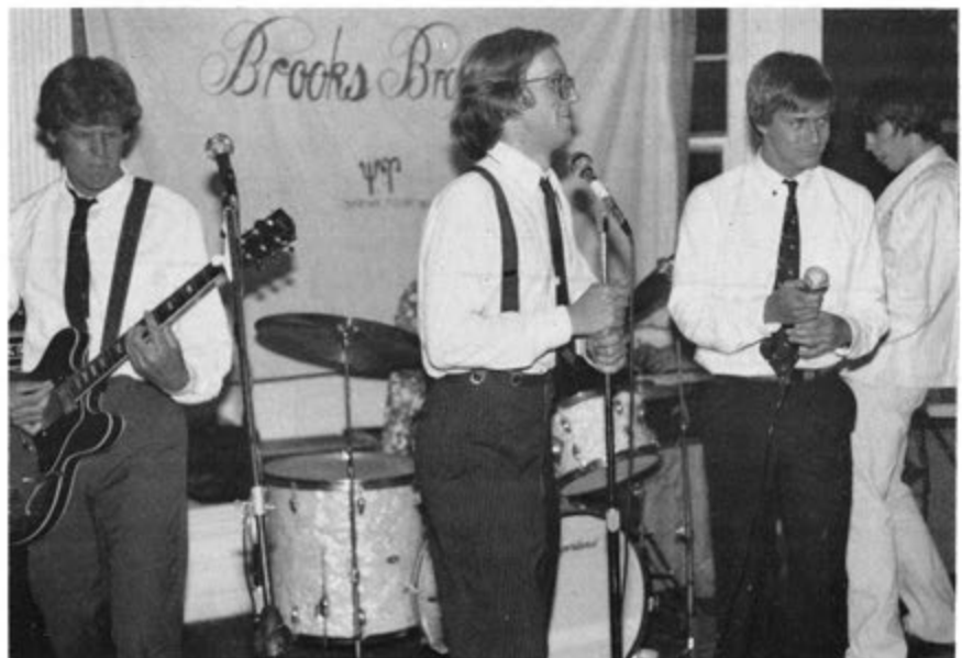
Psi U's very own band — "The Brooks Brothers."