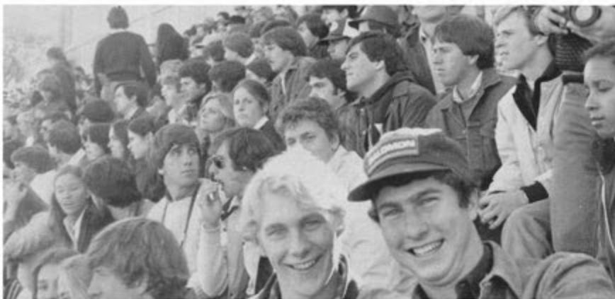
Psi U's House Block enjoys a quiet moment.