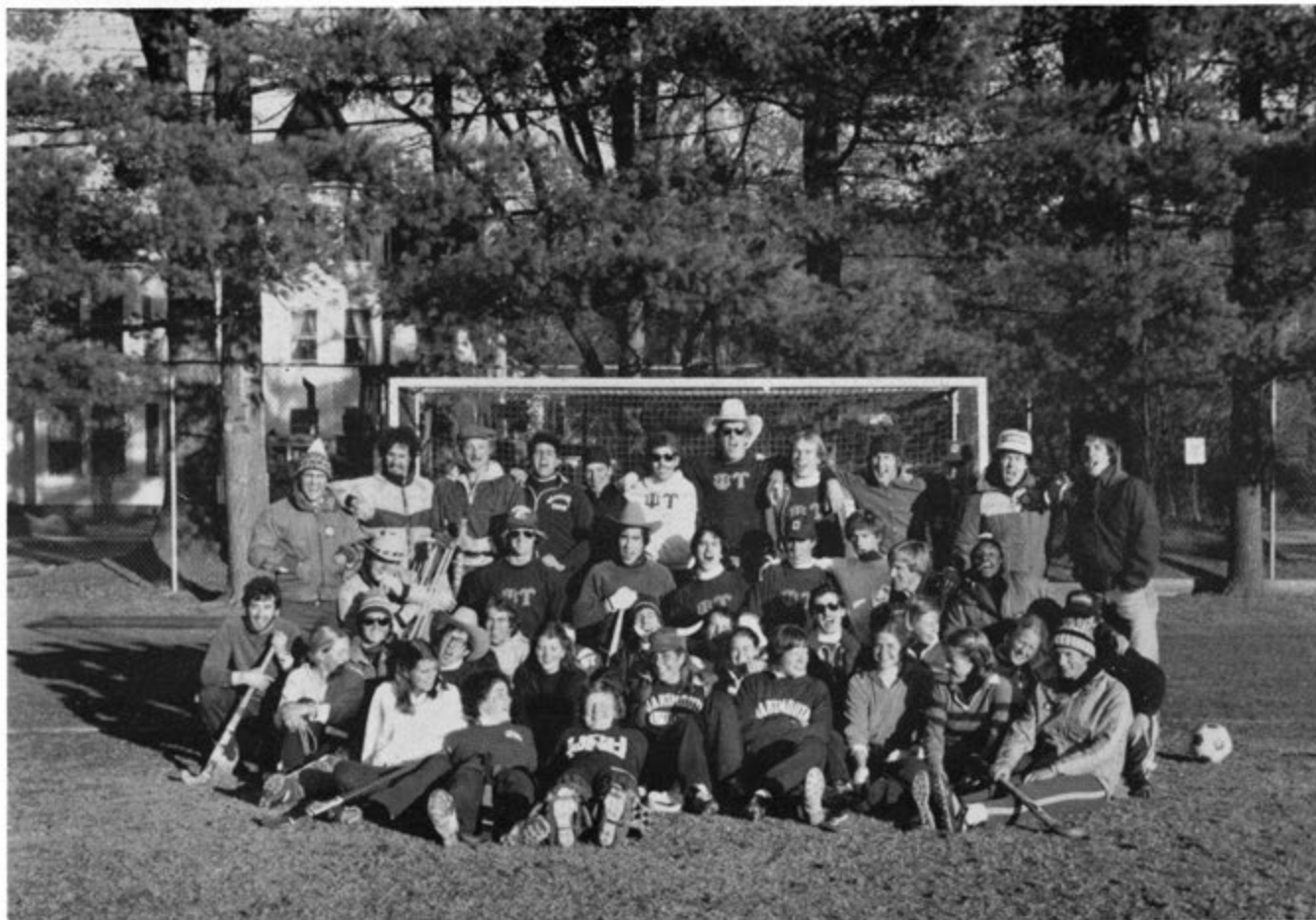
Uies pose for a photo following a 3-2 victory over the Women's Varsity Field Hockey team.