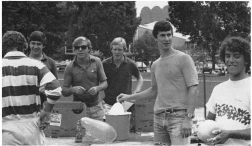
Uies prepare a Summer Carnival Booth.

The bathroom on the second floor got brand new fiberglass showers, and its third floor counterpart received a much needed and long overdue trap under the sinks. Many of the old pipes were replaced by more modern, plastic pipes by a professional plumber. The bathroom