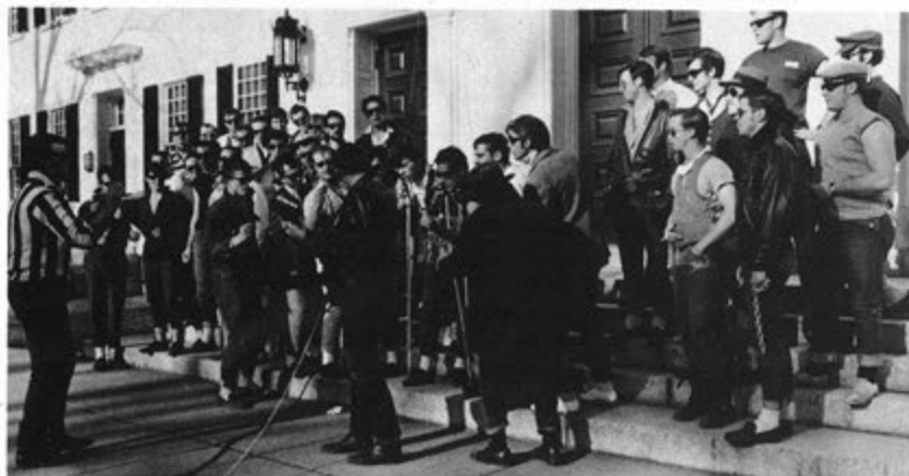
Appropriately attired, the Brothers gave new meaning to "oldies-but-goodies" from the late 50's.