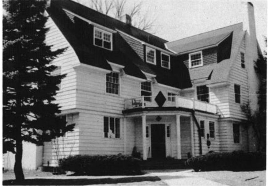
The Lodge valiantly survived another year of alternating efforts to improve and destroy it.