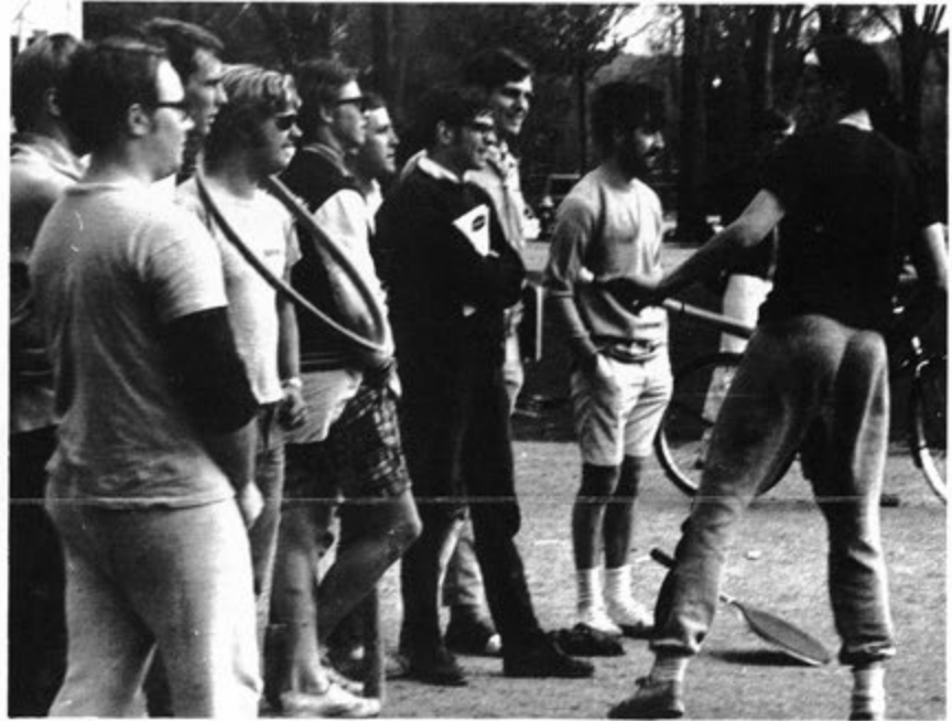
Brothers watch the action as Psi U's softball machine wins again.