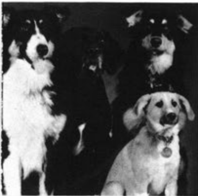
Kelsey, Rosie, Boot, and Beaver - only a few of the dogs that have lived in the House this year.