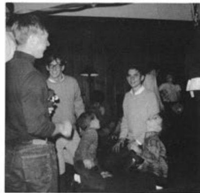
Our Christmas party for the Head Start children - in many ways much wilder than any other House party.