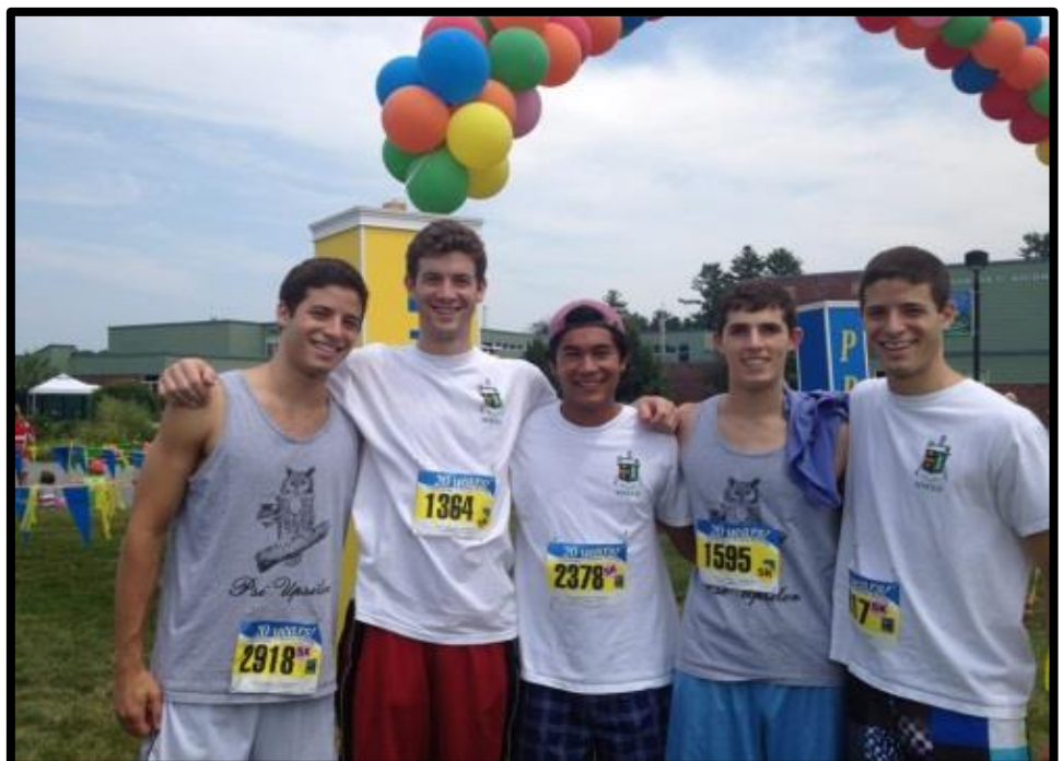
Brothers pose after a successful finish at the Prouty fundraiser in Hanover.