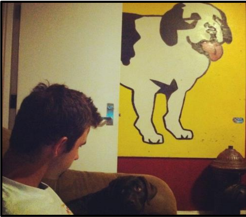
House Dog Argie gets comfy in the Kennel common room

throughout the house very well. It is worth noting here that in 9 months the college will be updating their wireless system in Greek houses. Therefore, we have the option to reduce our spending on wireless if we ask them to install 3-4 routers (depends on the structure of the house). These routers will be identical to the ones in the residence halls, and while the initial cost of them is quite expensive, the overall cost of our wireless will decrease.